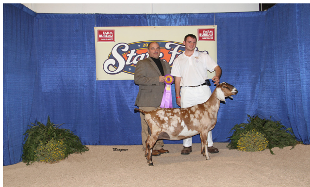
2016 Best Doe in Show - Ring 1