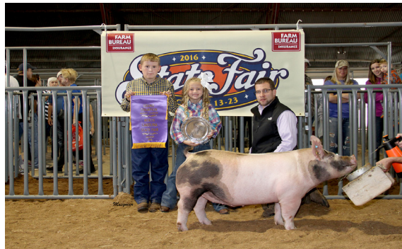
2016 Supreme Champion Market Hog

RESERVE SUPREME CHAMPION (On Foot)..... Plaque & $100.00