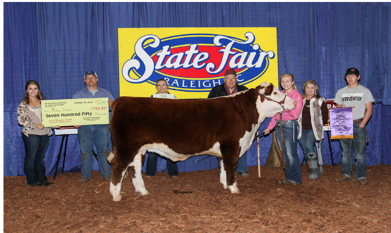
2016 Grand Champion British Breed Junior Market Steer

The State Fair Management will pay mileage compensation for animals exhibited in the Junior Steer Show as outlined here. Payment will be made for each animal based on the distance (one-way) between the county seat of the county involved and Raleigh. Payments will be made on the basis of $.50 per mile per animal.